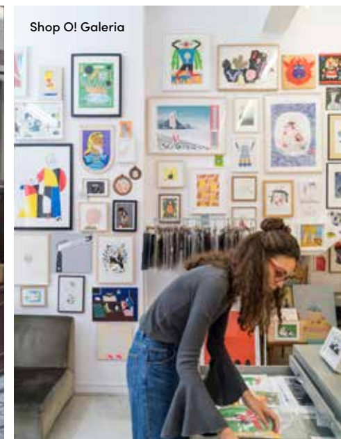
Shop O! Galeria