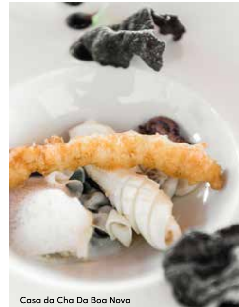
Casa da Cha Da Boa Nova