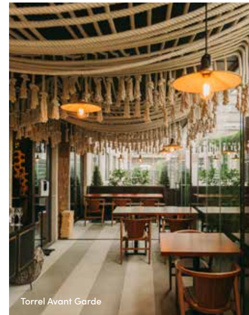
Torrel Avant Garde

Set high on the banks of the Douro, art is at the centre of Torel Avantgarde with local artists and materials celebrated throughout