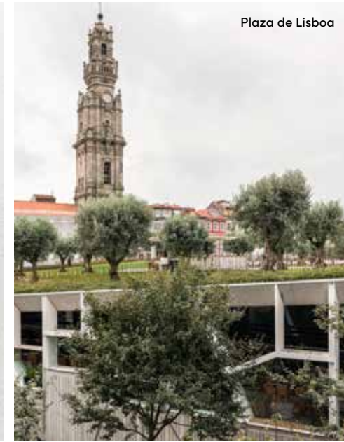
Plaza de Lisboa