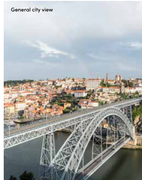
General city view