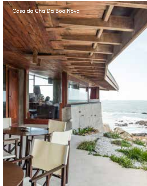
Casa da Cha Da Boa Nova